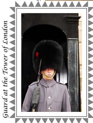
Guard at the Tower of London