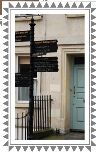
Bath signpost, City Center